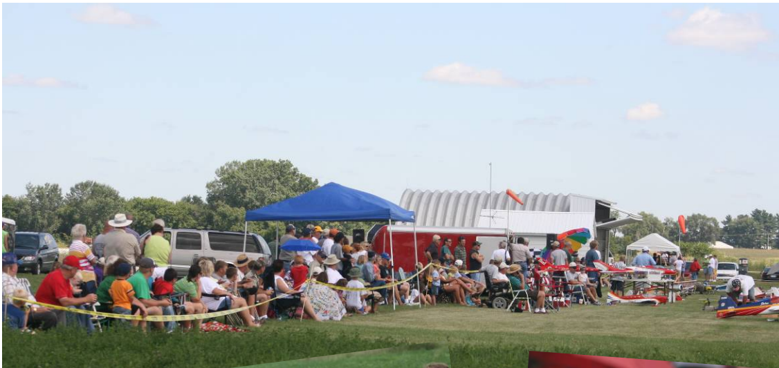
A perfect day to take the family to an air show