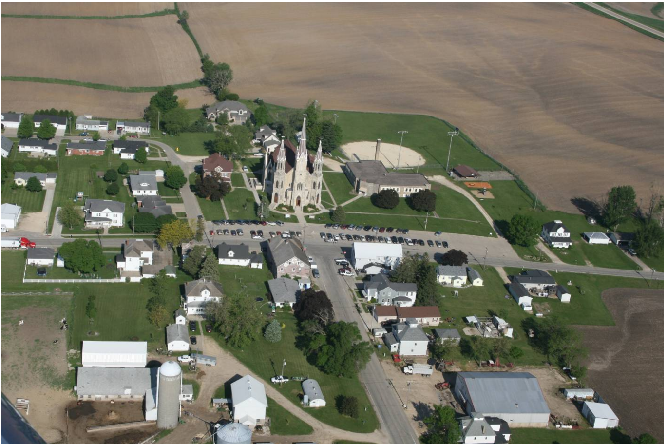
Ss. Peter & Paul Catholic Church in Petersburg, Iowa on a typical Sunday morning.