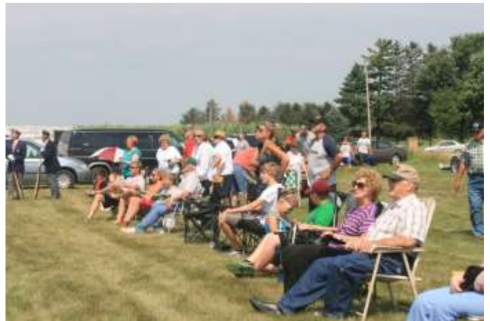
The Hangar offered shade for some and others preferred the outdoors