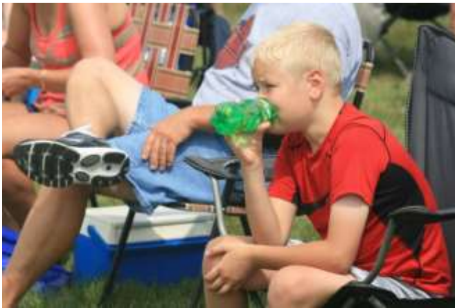
This fellow knows how important it is to stay hydrated watching the show.