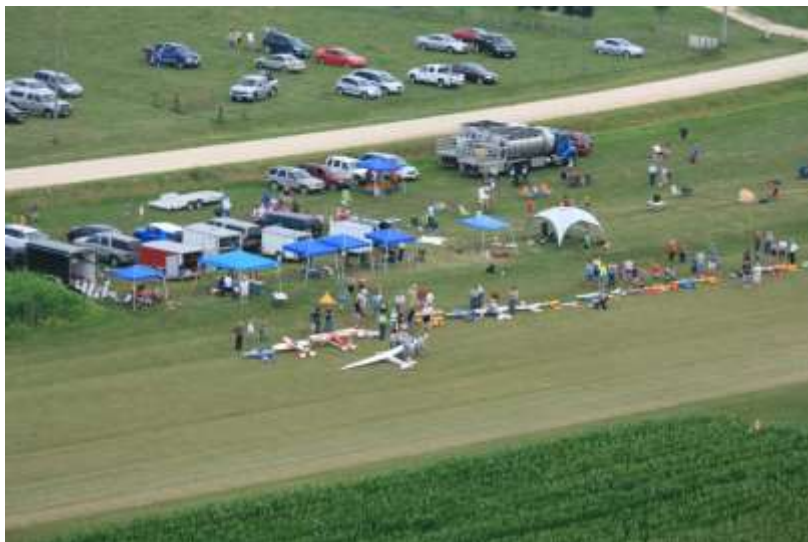
The four hour show ended but many people stayed to look at the planes, ask the pilots questions and encourage many pilots to fly "one more time".