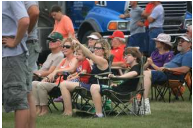
Excitement every minute