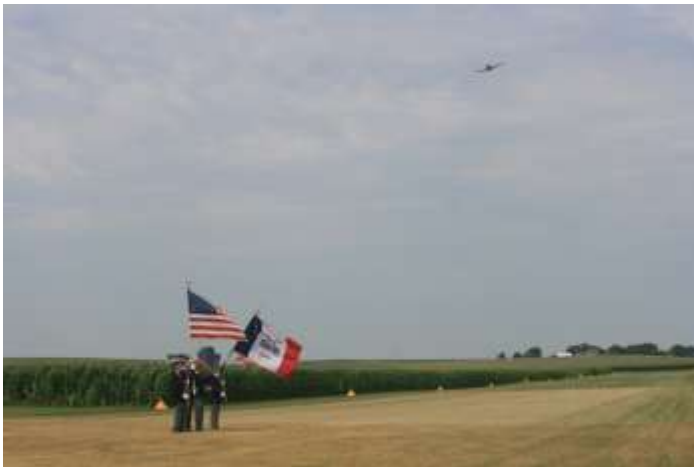
Dyersville Legion presents the Colors as a Sky Raider does a low pass