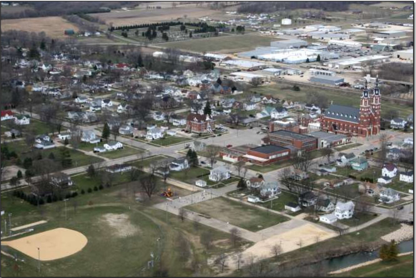
Westside Park before FEMA purchased the homes

Organization of the airport supporters is underway. When the LLC is established, stock will be sold to pay for as much debt as possible. We figure we have to sell 44 shares of stock, we can borrow the rest and make it pay. Many of the pilots have already committed to several shares. If anyone or any group is interested in helping the airport, we have a Power Point we can show so you will know how it will be run and what our goals are. If you are interested, call one of the Board Members and he will arrange a showing.